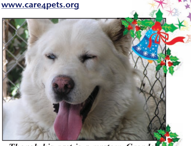
Though his past is a mystery, Grendel is a lovely boy! Today he is safe, enjoying another holiday season!

NON PROFIT U.S. POSTAGE PAID PERMIT #1 NO. HOLLYWOOD, CA