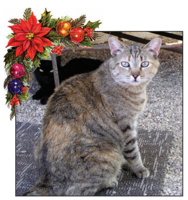
Hey! You'd better have a wonderful Holiday and a terrific New Year! Thanks to your kind support, I know we will!

The C.A.R.E. sanctuary demonstrates that is possible to provide a comfortable and loving home for groups of "unwanted" or "surplus" animals who otherwise would have, at best, an uncertain future. By supporting C.A.R.E., you are not only helping many wonderful animals, you are also standing up for the idea that animals do matter, and that they deserve loving care!