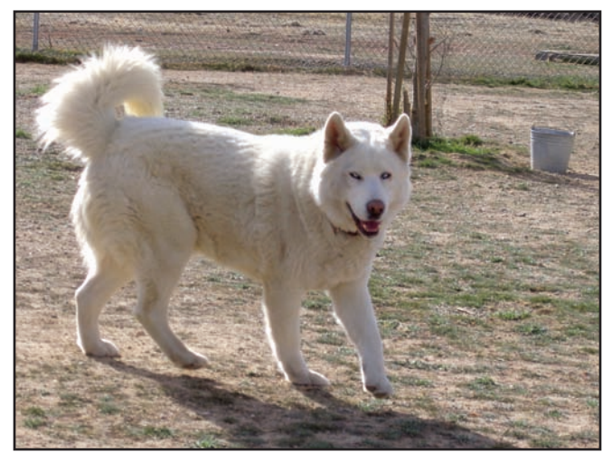
Grendel loves to see what's new in the dog's exercise yard!