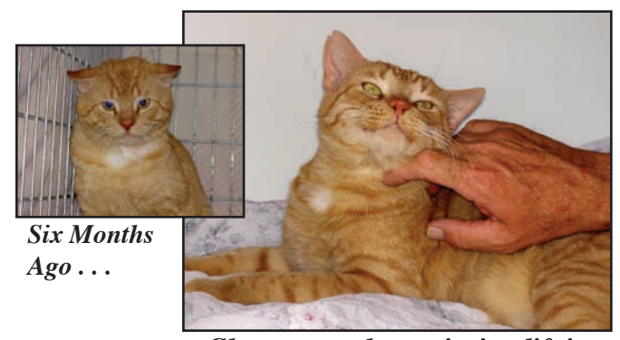
Chauncey today, enjoying life!

SSSHHH! Believe it or not, this is <u>Chauncey</u>, our so-called "feral" Katrina Kitty. This boy came to us thin, sick, and scared. He would lower his ears and hiss if you just looked at him! Well, don't tell his buds back in New Orleans, but Chauncey isn't such a tough guy anymore! Look at him relishing a scratch on his chinny-chin-chin! After some major TLC, he's turned out to be a real sweetie!!