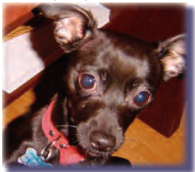
Millie - Recycled no more!

Supported entirely by donations from individuals and foundations, C.A.R.E. maintains a no-kill, cage-free "Home Sweet Home" for up to 200 homeless cats & dogs in a rural area north of Los Angeles. The C.A.R.E. sanctuary is licensed by the County, proudly earning "A" ratings at every inspection!