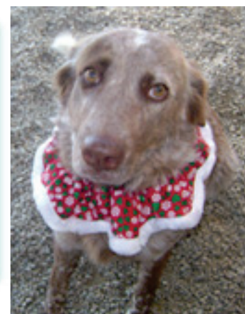
Suzie-what an adorable face!!!