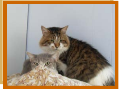
Thank you for supporting C.A.R.E. and helping many more dogs and cats to have a safe loving home-sweet-home!!!