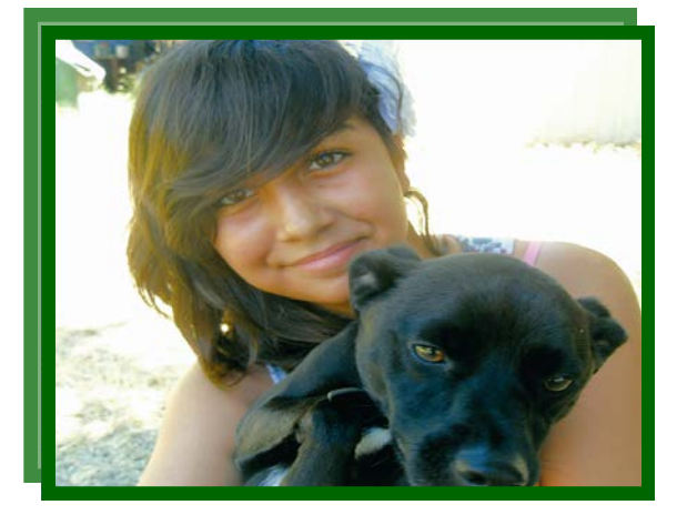
Gentle Zorito, finally got his forever home - rescued from euthanasia at the pound now safe and happy forever!!!!