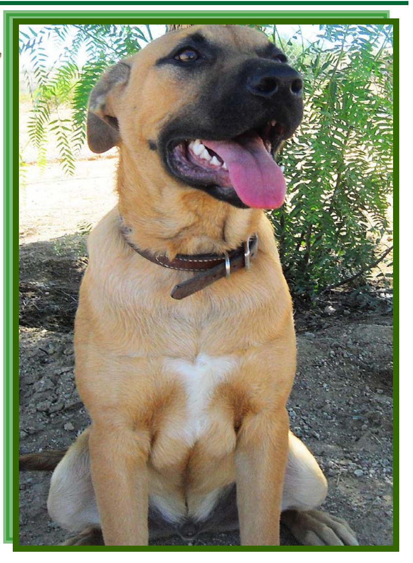
Oliver has come a long way from the day he was rescued from the desert. He is growing up, happy, playful and safe...Thanks to you!