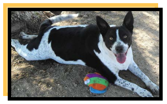
Delilah relaxing and cooling down after playing in the exercise yard.