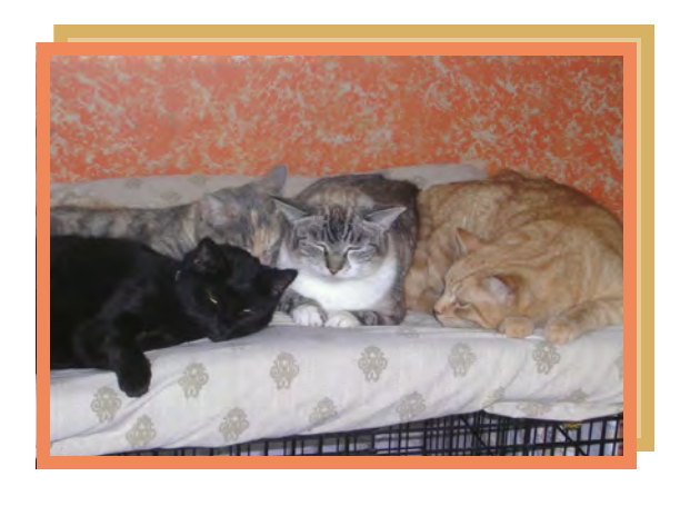
Best of friends sharing a relaxed afternoon in a favorite spot- enjoying each other's company and the stress free life!

Supported entirely by donations from individuals and foundations, C.A.R.E. maintains a no-kill, cage-free "Home Sweet Home" for 300 plus homeless cats & dogs in a rural area north of Los Angeles. The C.A.R.E. sanctuary is licensed by the County, proudly earning "A" ratings at every inspection! We are committed to saving the lives of homeless dogs and cats by rescuing at-risk animals, placing adoptable pets in homes of their own, and caring for those awaiting adoption (even those considered "unadoptable"), for the rest of their lives if need be. The C.A.R.E. sanctuary demonstrates that is possible to provide a comfortable and loving home for groups of "unwanted" or "surplus" animals who otherwise would have, at best, an uncertain future. By supporting C.A.R.E., you are not only helping many wonderful animals, you are also standing up for the idea that animals do matter, and that they deserve loving care!