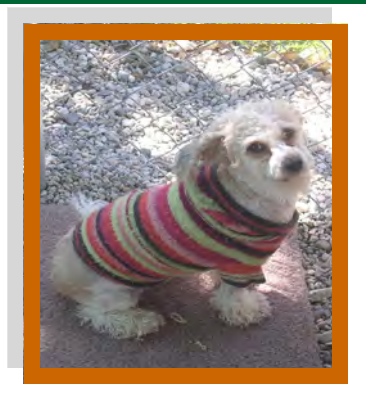
Roscoe after a visit to the barber