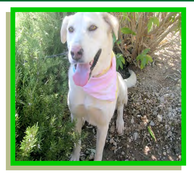
Delilah—what a sweetheart – how could someone have abandoned her, just like that???