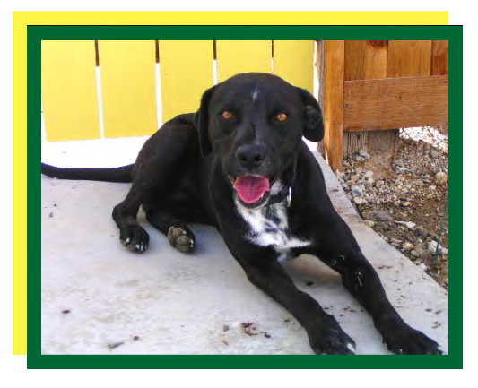
Buddy, left tied at the side of the California aqueduct. He has some trusting issues: I wonder why?