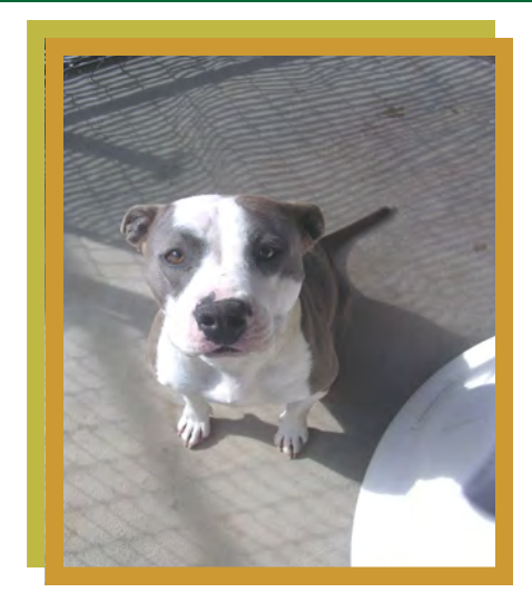
Beautiful Ellie, left in the desert to die. After one week at the vet she is feeling and looking much better! Now she has a new lease on life!