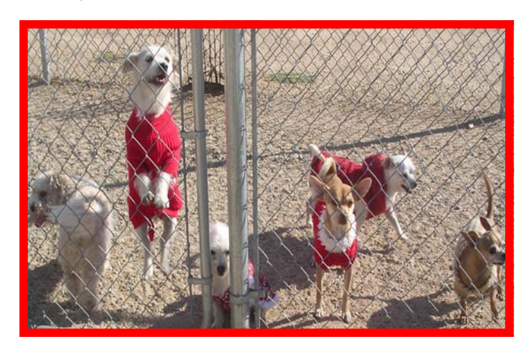
Little buddies in the exercise yard making a fashion statement!