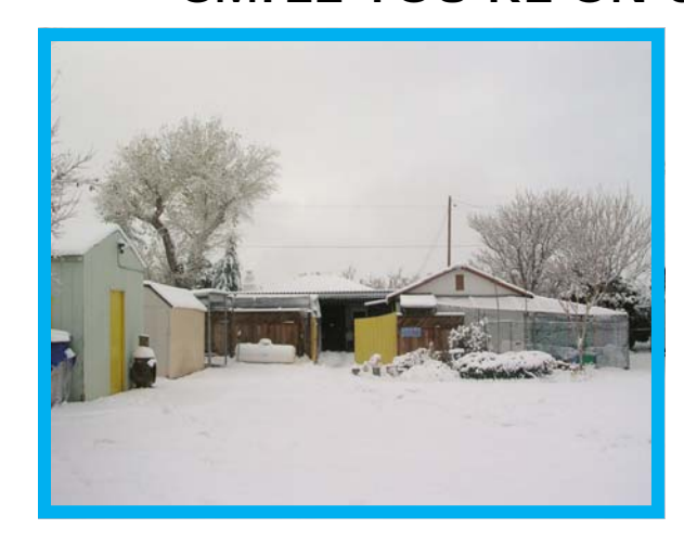
The CARE Sanctuary Winter 2011. Doesn't it look beautiful? Yes, it does snow in the desert in South California!