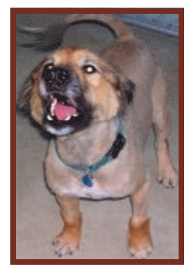
Senior Beamer, C.A.R.E's new arrival, lost his home when his humans lost theirs'. Now he is safe, and happy... because of your support. Beamer is "beaming" at you!!!

She thanks you for your support and generosity!