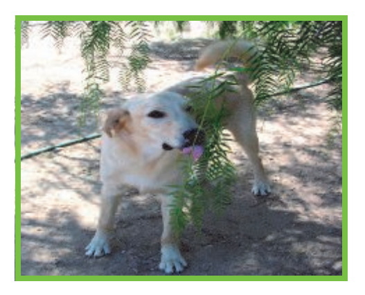
Oso, does not he look great? Well he does know, today he is healthy, happy very playful and sweet, but when he was rescued it turn out that he had the deadly disease parvo. It was touch on go for a long while, but with great care from our vet and staff-he made it. Yes he is a very lucky doggy!!!

Supported entirely by donations from individuals and foundations, C.A.R.E. maintains a no-kill, cage-free "Home Sweet Home" for 300 plus homeless cats & dogs in a rural area north of Los Angles. The C.A.R.E. sanctuary is licensed by the County, proudly earning "A" ratings at every inspection! We are committed to saving the lives of homeless dogs and cats by rescuing at-risk animals, placing adoptable pets in homes of their own, and caring for those awaiting adoption (even those considered "unadoptable"), for the rest of their lives if need be. The C.A.R.E. sanctuary demonstrates that is possible to provide a comfortable and loving home for groups of "unwanted" or "surplus" animals who otherwise would have, at best, an uncertain future. By supporting C.A.R.E., you are not only helping many wonderful animals, you are also standing up for the idea that animals do matter, and that they deserve loving care!