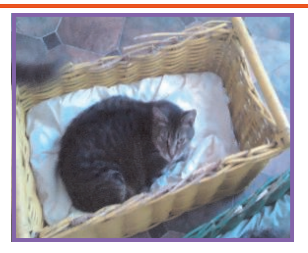
Sweet Francesca - just trying to grab a snooze, when - OH NO! Not the paparazzi again with their bright lights and cameras!!!

Here are some of the wonderful dogs and cats that call C.A.R.E. home. Their days are spent chillin', playing, eating yummy stuff, surrounded by love and kindness, and receiving great veterinary care to keep them healthy and enjoying life. But - they only can have these with your support and generosity. You are the ones who make it all happen. The <u>little guys in this issue and many more</u> at C.A.R.E. are looking for a forever home! Maybe it might be yours!!! Please give so the mission can go on and we can keep on rescuing those at risk - the voiceless ones in jeopardy!