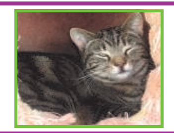
Adorable Scooby in his favorite place having a quiet relaxing time!

Make your tax deductible donations at www.care4pets.org. We can't do this without you!!!!