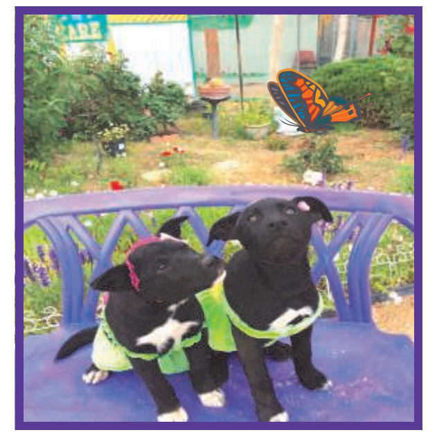
Guri and Simone—Nuri's two little girls