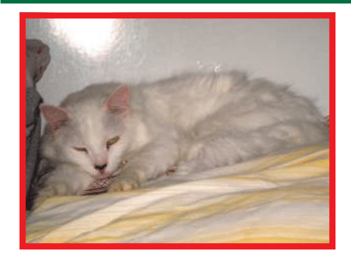
White Feather, is an amazing, beautiful, loving senior cat.

Please give today so we can keep the cats and dogs in our sanctuary safe and well cared for, and to save more cats and dogs at risk; their survival depends on us! Our future, their future depends on your generosity and kindness! The animals in this issue and many more at the C.A.R.E. sanctuary are looking for homes of their own!