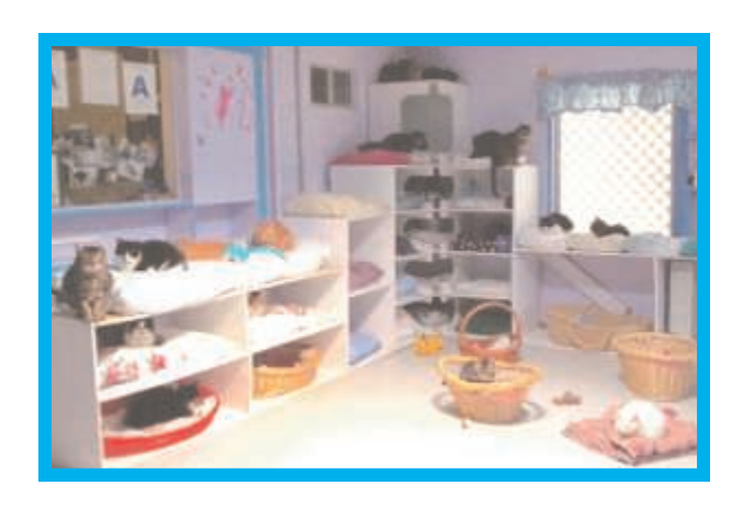
Napping kitties in the "sun room" - not a care in the world, thanks to your generosity!