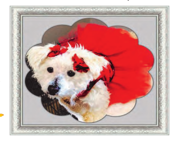
Sweet little Honey is so CUTE and is looking for a forever loving home!!!

Beautiful Iris is available for adoption!!!