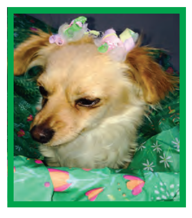
Honey—such a cute and sweet little girl and another poor little dog that was abandoned. We can never understand how some people can walk away and leave these poor souls to fend for themselves. Really, WHAT in heaven are they thinking? Unbelievable!

Supported entirely by donations from individuals and foundations, C.A.R.E. maintains a no-kill, cage-free "Home Sweet Home" for 300 plus homeless cats & dogs in a rural area north of Los Angeles. The C.A.R.E. sanctuary is licensed by the County, proudly earning "A" ratings at every inspection! We are committed to saving the lives of homeless dogs and cats by rescuing at-risk animals, placing adoptable pets in homes of their own, and caring for those awaiting adoption (even those considered "unadoptable"), for the rest of their lives if need be. The C.A.R.E. sanctuary demonstrates that is possible to provide a comfortable and loving home for groups of "unwanted" or "surplus" animals who otherwise would have, at best, an uncertain future. By supporting C.A.R.E., you are not only helping many wonderful animals, you are also standing up for the idea that animals do matter, and that they deserve loving care!