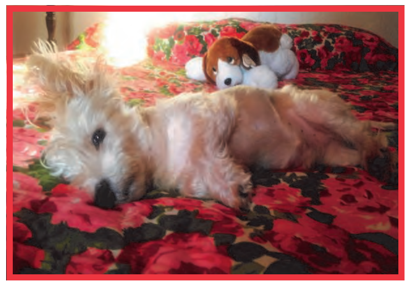
Little Bruno thanks you for helping C.A.R.E. so he can be safe!!!

Look at these little cuties. Don't they look so adorable? These beauties have come a long way since the day they were rescued with their mother from a very bad situation. They are all growing up now. They are about 5 months old and looking for forever loving homes!!! The center is Helga, left is Harry, back is Hera, right is Heidi and there is other hiding, can you see her?