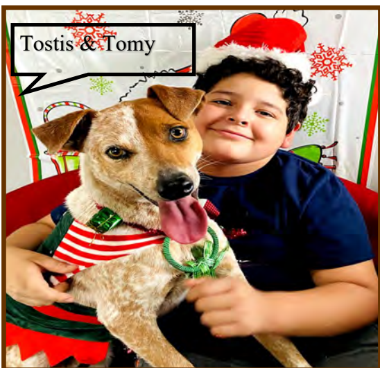
Tostis & Tomy