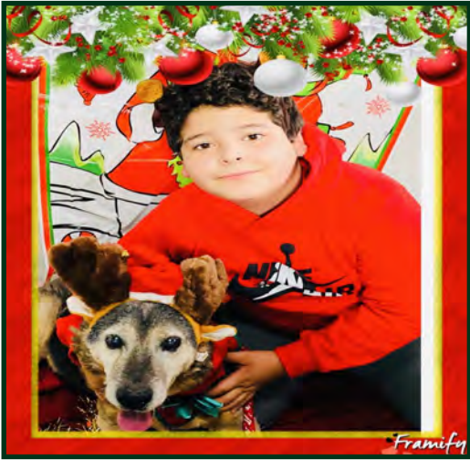
This beautiful senior is August and a shelter survivor.

Cat/Canine Assistance, Referral & Education P. O. Box 56631, Sherman Oaks, CA 91413 www.care4pets.org