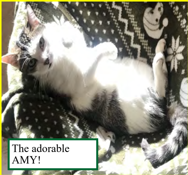
The adorable AMY!