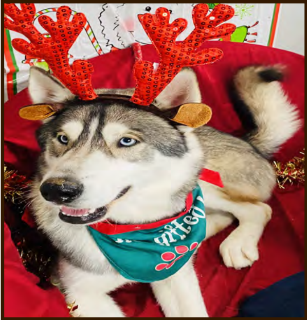
This beautiful boy is Winter, he is all dressed up for the Holidays! Winter was dumped in the desert close to our sanctuary. A very sweet 6 month old with a lot of energy, he is ready for his forever loving home. If you are looking for a young cutie, he is the one for you!

Supported entirely by donations from individuals and foundations, CARE maintains a no-kill, cage-free “Home Sweet Home” for 300 plus homeless cats & dogs in a rural area north of Los Angeles. The CARE sanctuary is licensed by the County, proudly earning “A” ratings at every inspection! We are committed to saving the lives of homeless dogs and cats by rescuing at-risk animals, placing adoptable pets in homes of their own, and caring for those awaiting adoption (even those considered “unadoptable”), for the rest of their lives if need be. The CARE sanctuary demonstrates that is possible to provide a comfortable and loving home for groups of “unwanted” or “surplus” animals who otherwise would have, at best, an uncertain future. By supporting CARE, you are not only helping many wonderful animals, you are also standing up for the idea that animals do matter, and that they deserve loving care!