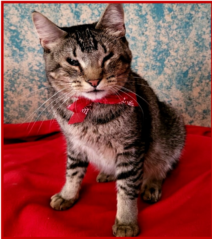
Sweet Elvis is vision impaired but that doesn't stop him from being a very happy and playful boy!