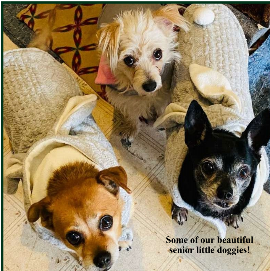
Some of our beautiful senior little doggies!