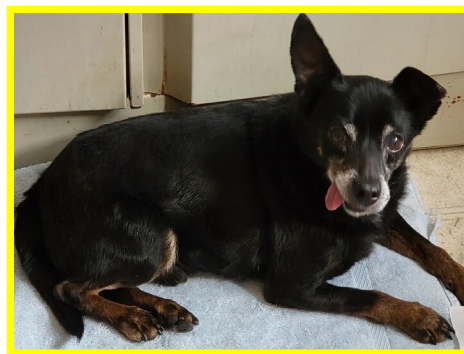
Rudy, one of our little seniors!

OUR RESCUED ANIMALS NEED YOUR HELP! PLEASE DONATE TO CARE!