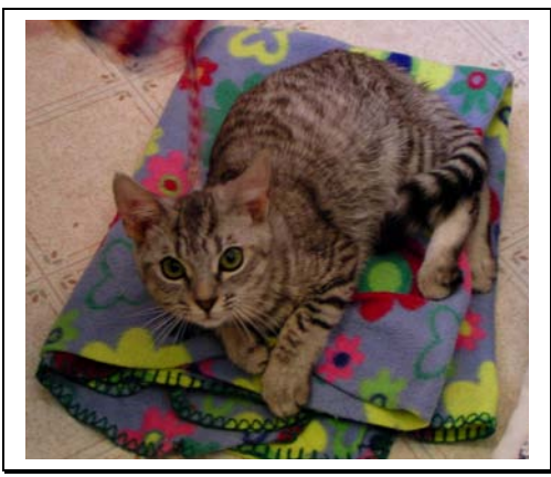
Harley & Annie , a brother & sister, were rescued last year. Although they look like 4-month old kittens, actually they are almost a year old. They suffer from a genetic disorder, Osteogenesis Imperfecta . It prevents their bones from absorbing calcium, even when serum calcium levels are adequate. (It affects the human species, too.) These animals will require special medical treatment and handling for the rest of their lives. In spite of their problems, they are happy sweeties being spoiled rotten by our loving staff!