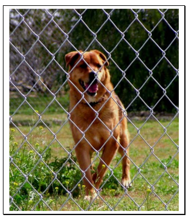
Here is Fanny playing in the dog's exercise yard.

We are committed to saving the lives of homeless dogs and cats by rescuing at-risk animals, placing adoptable ones in homes of their own, and caring for those awaiting adoption (and those considered conventionally "unadoptable") in our sanctuary, for the rest of their lives. Many of the cats and dogs here have special needs and each receives the individual care and attention they need to lead a happy, healthy life.